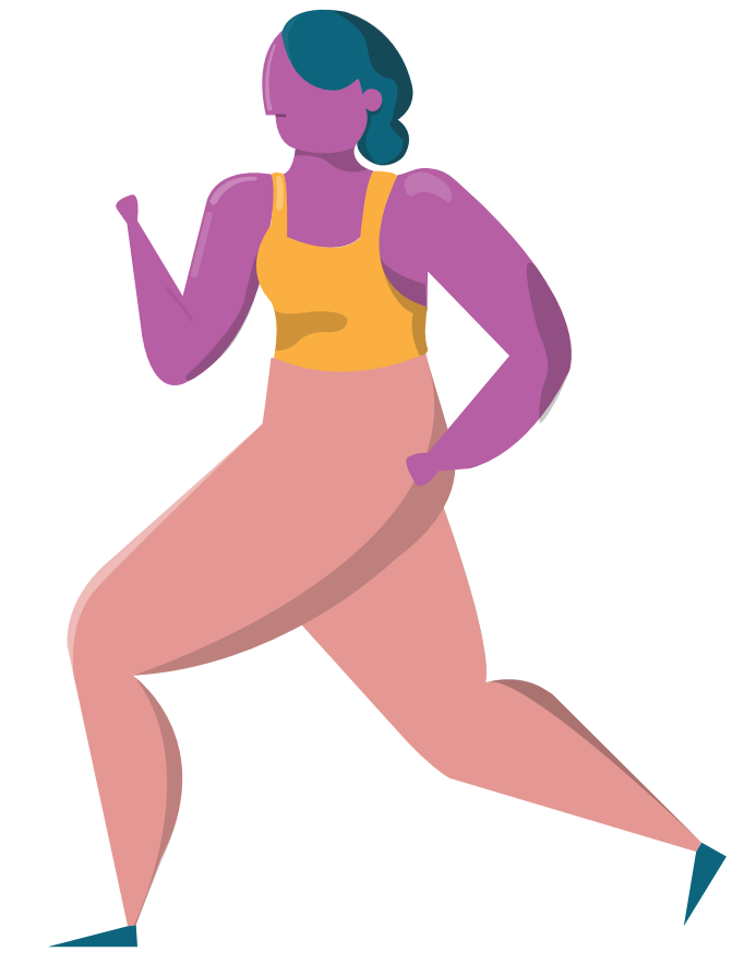
Going for a run