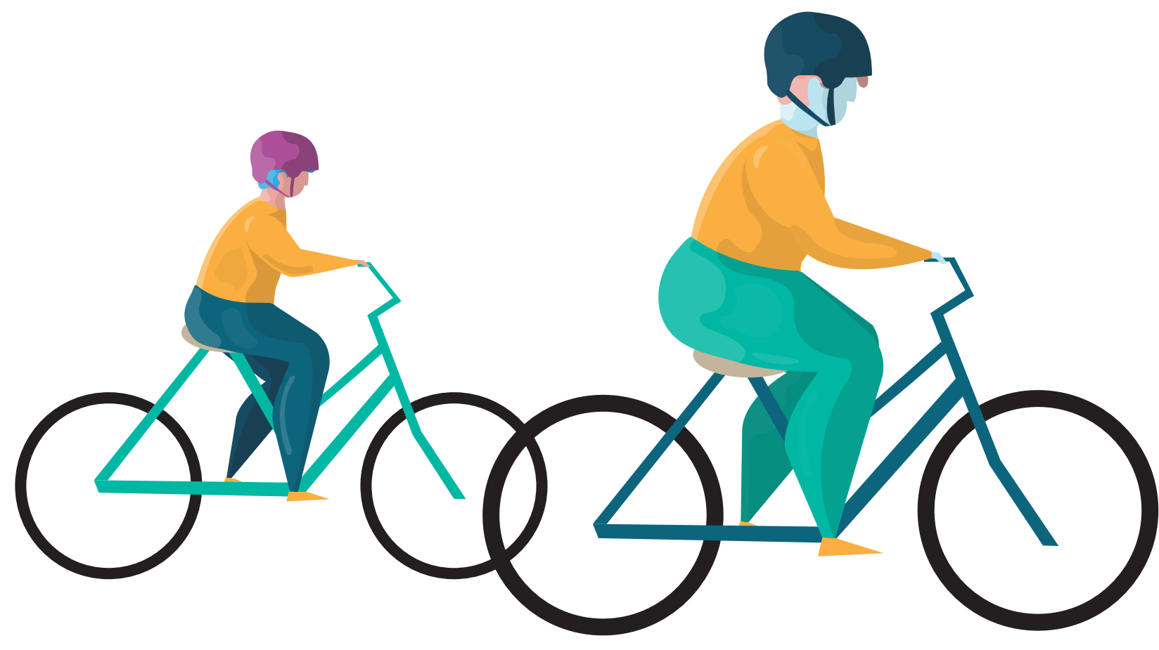
Going for a bike ride