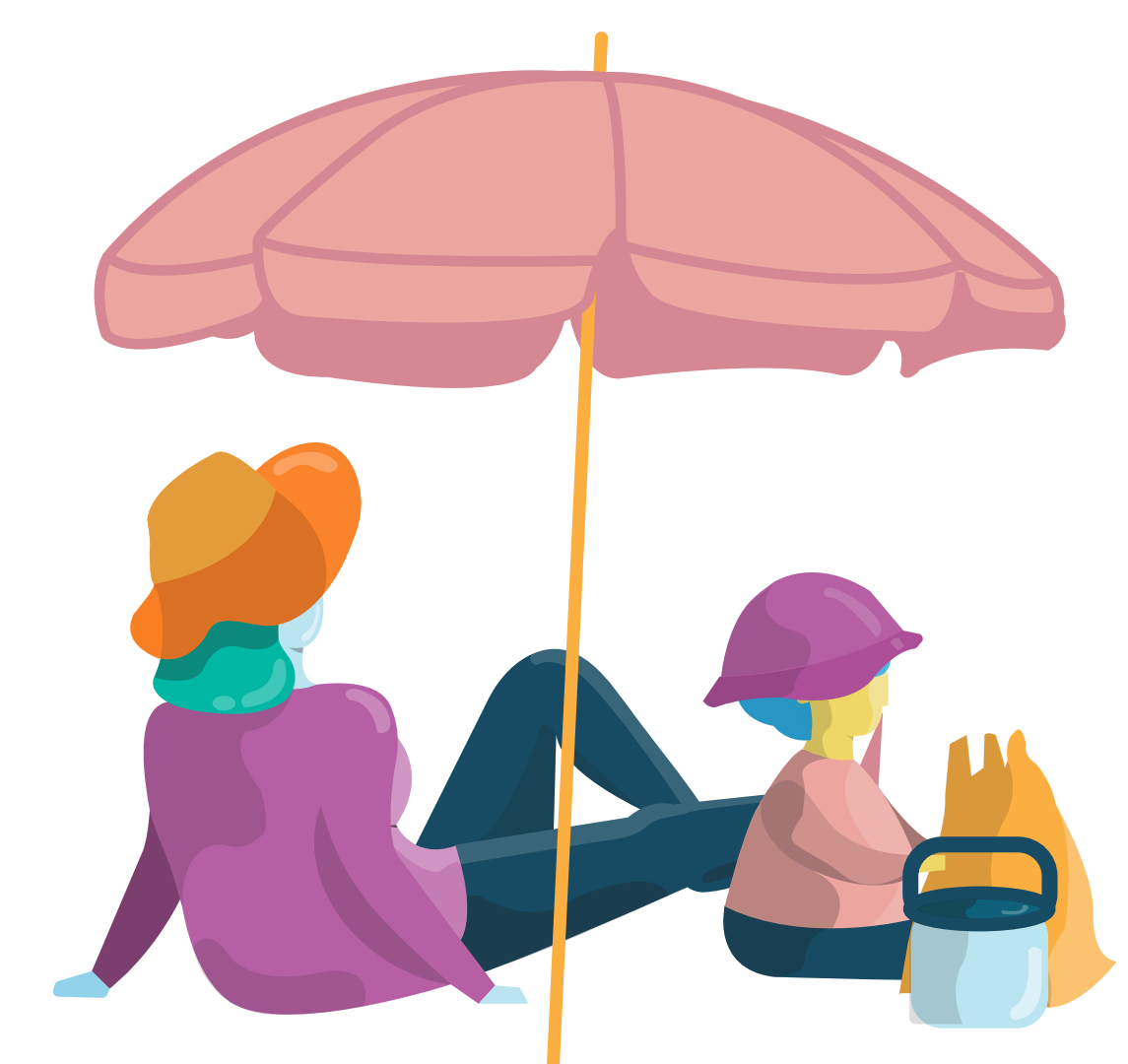
Relaxing day at the beach

We don't need sports or energy drinks to fuel a busy day